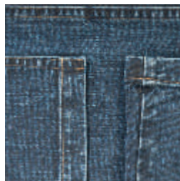
Fig. 3: Tinting and over-dyeing