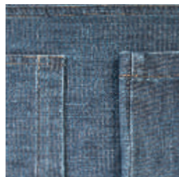
Fig. 2: Resin finish and flat finish