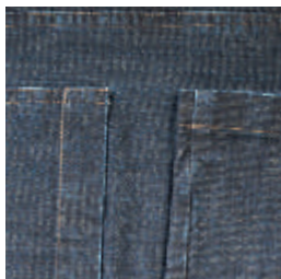
Fig. 1: Fixation of indigo and sulphur dyes